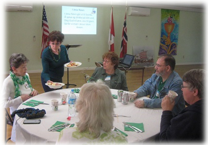
Members and guests enjoyed being served our meal and being entertained with a skit "The Troll and the Leprechaun".