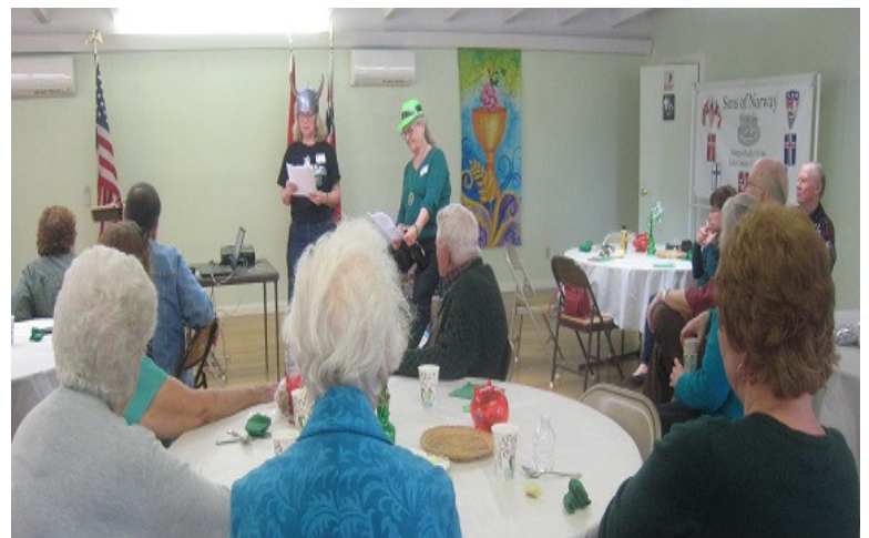
Everyone was all ears during the skit!