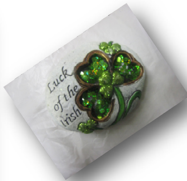
Lucky because the Vikings founded Dublin!!