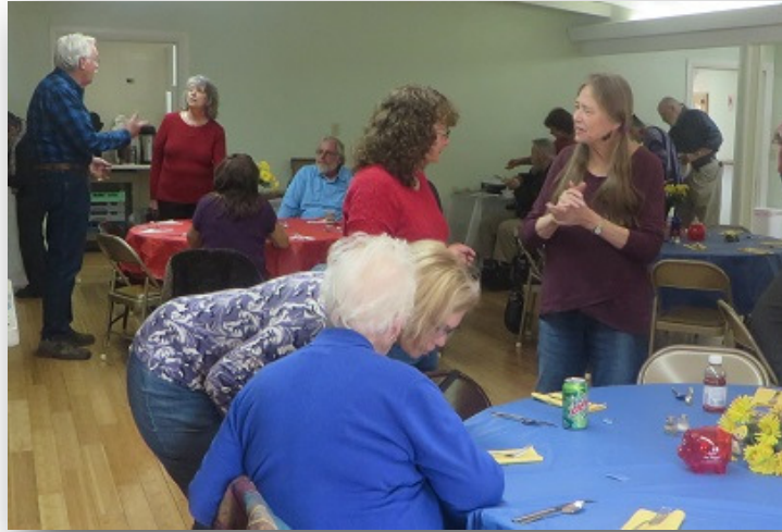
Lots of folks having fun—32 total this day!