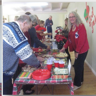
Great food, as always!