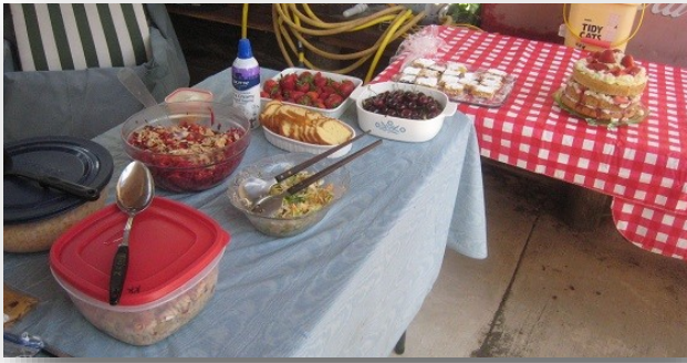
Many delicious side dishes brought by the members!