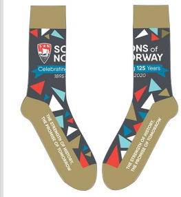
MB shows off her socks!!