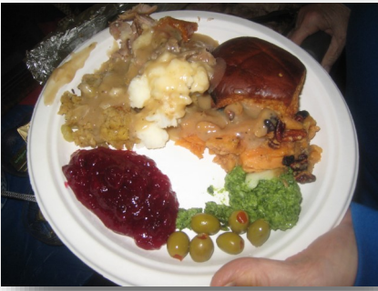
Delicious Potluck Turkey Dinner—with all the side dishes!