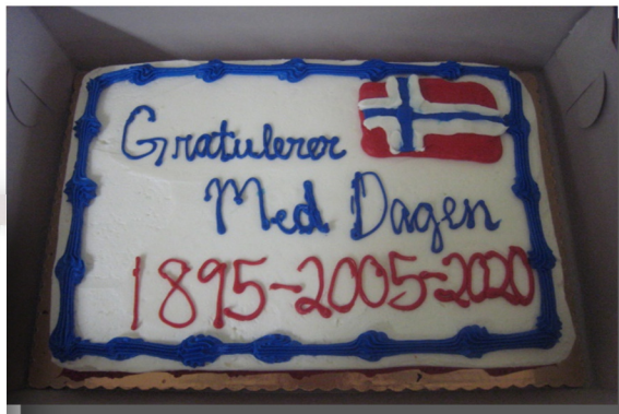
SONS —1895 Vikings of Lake—2005 It's a celebration!!