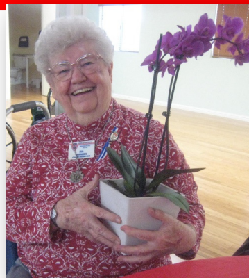
Looking back at our past—and toward our future!!