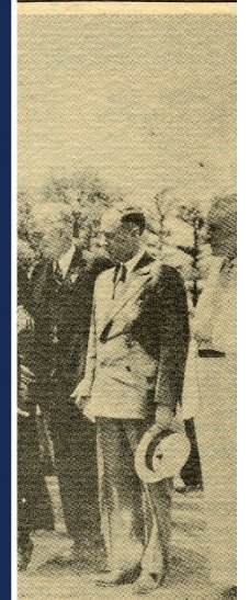
dedicated by State