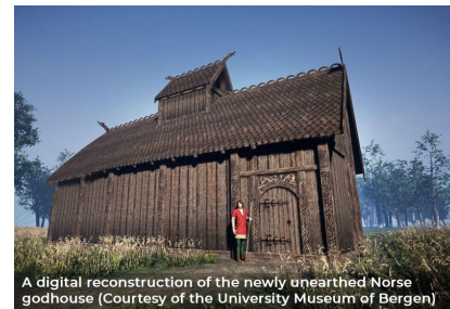
A digital reconstruction of the newly unearthed Norse godhouse

In the village of Ose, Norway, archaeologists from the University Museum of Bergen recently uncovered the remains of an eighth-century "godhouse." In its day, this structure was dedicated to the worship of the old Norse gods and housed ceremonies such as midsummer or mid-winter solstice. This is a particularly special discovery as it is the "first temple of its kind identified in Norway," according to Smithsonian Magazine. Through digital reconstruction, researchers were able to determine that it resembles similar temples found in southern Sweden and Denmark.