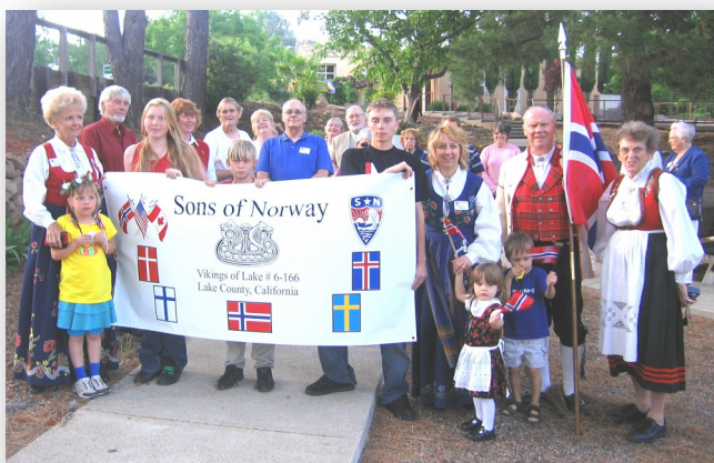
Left—When we began in 2005. Big celebration!!