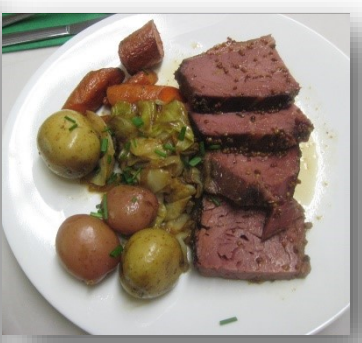
Corned beef, carrots, potatoes and wonderful cabbage.

Kris and Pam work hard to cook and dish up this delicious meal.